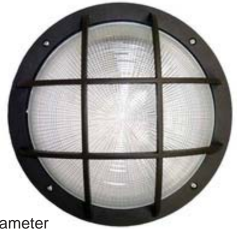
15" Diameter 9-1/4" from Wall

The chart is based on a W96 wall mounted 10' above the ground. Each iso-line represents the footcandle level along the path. Each square represents the mounting height. To change the height of the fixture or to change the wattage use the multipliers below.